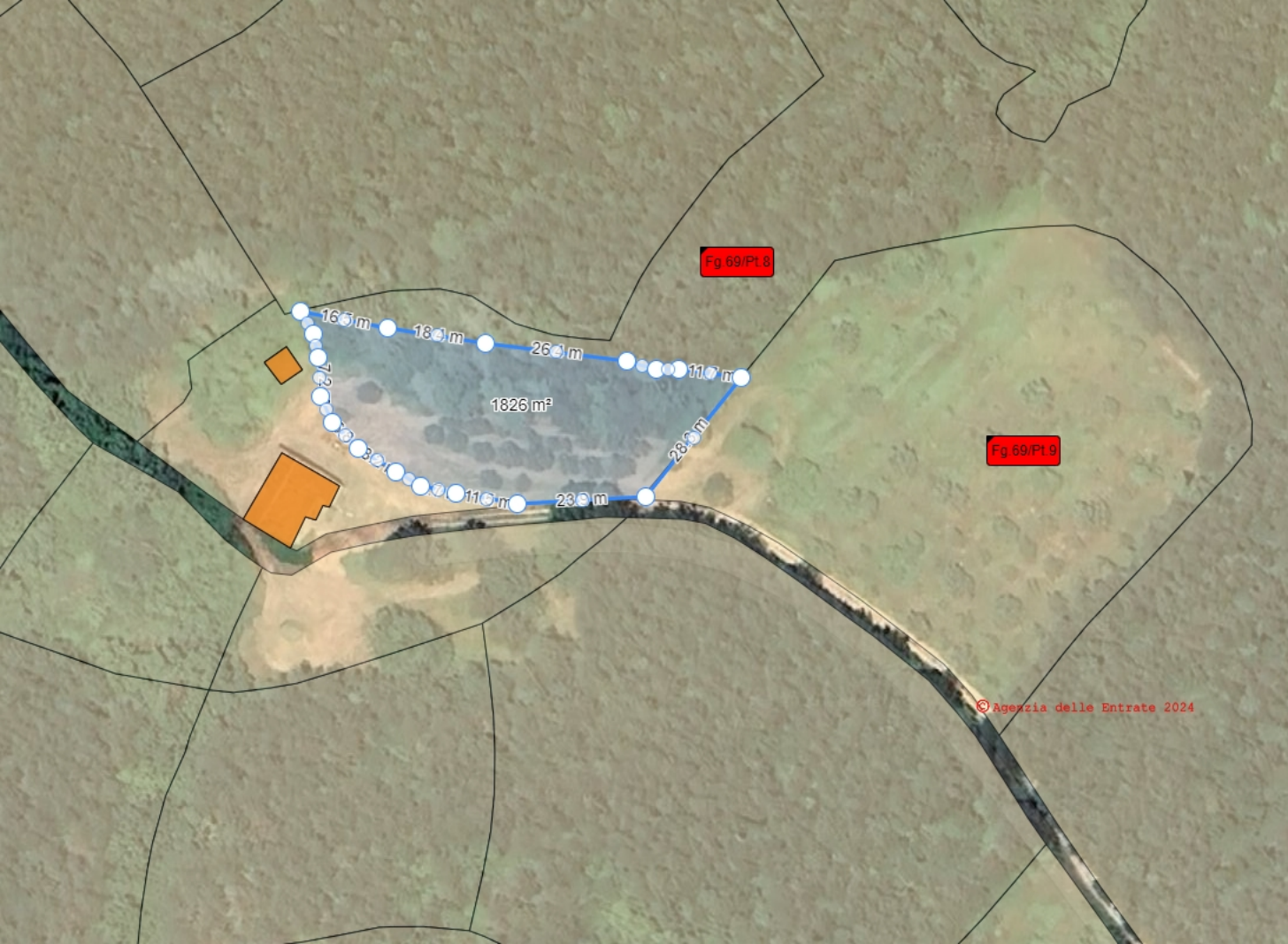
Fig. 69/Pt. 8